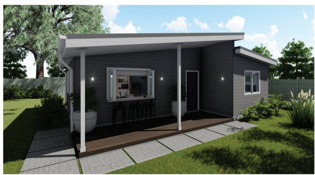
MORE FACADES AVAILABLE